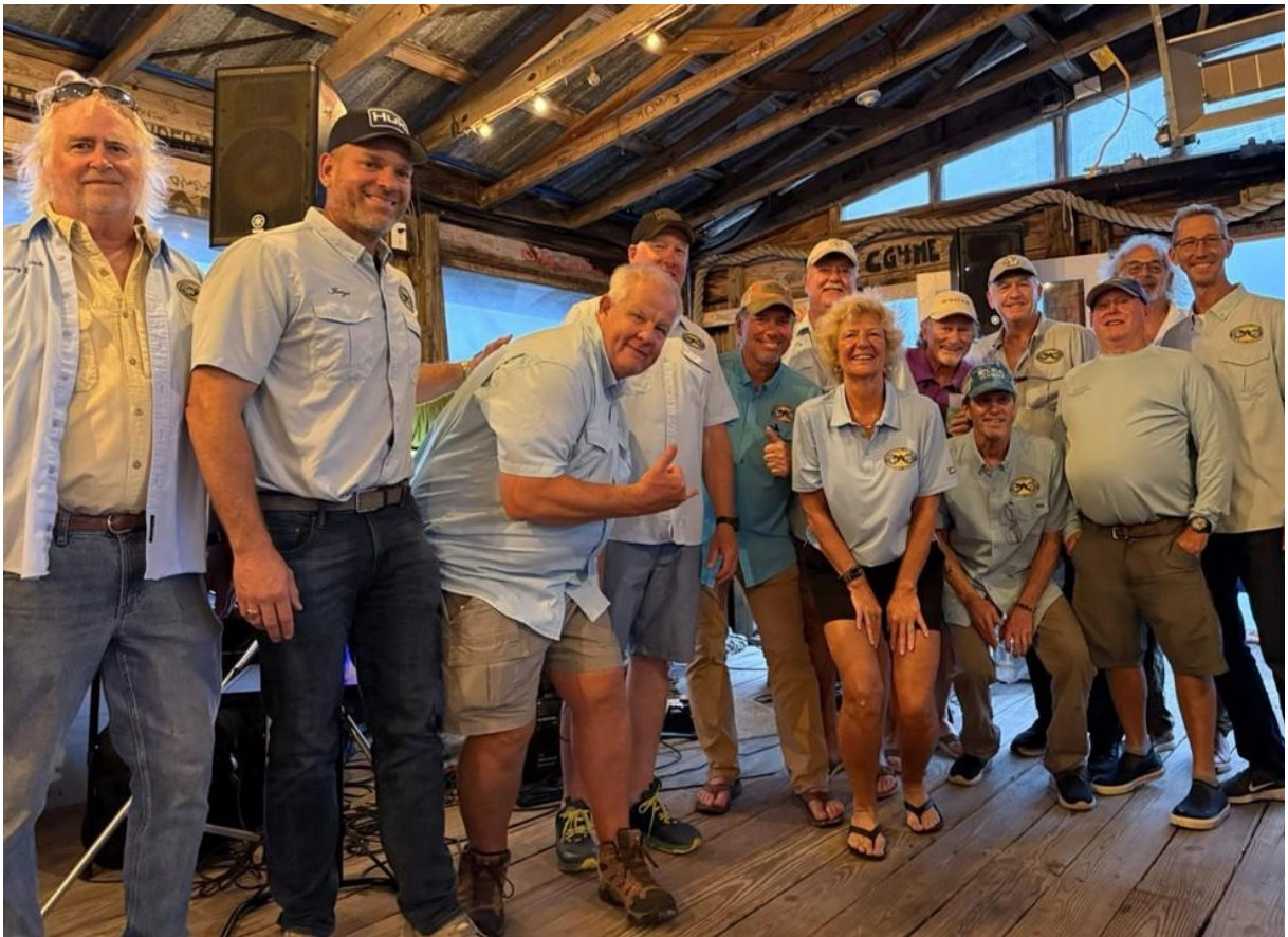
Charleston Observers.