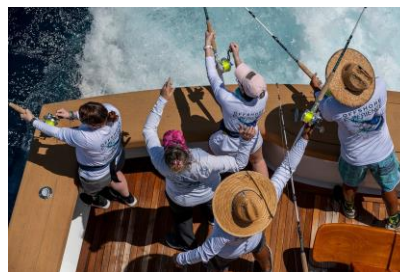
Several Veterans hooked up on a Freedom Alliance Offshore Experience.

In its 27 th year, this tournament is a real sleeper among the Central American tournament circuit. Held November 9-12, 2021 the participants consisted of local boats and a few boats traveling from Guatemala. It has proven to be outstanding in the catch quality, hospitality, and friendliness of the organizers and hotel staff. No, it is not a five-star resort, but the hotel was well managed and the cold showers were actually refreshing.