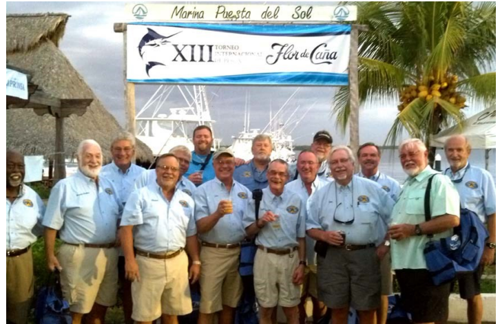
IGFTO observers at the Flor de Caña International Billfish Tournament in Nicaragua in August

IGFTO Observers have distributed hundreds of flyers, newsletters and bucket stickers during tournaments around the world in an effort to spread the IGFTO mission of conserving game fish through catch and release venues.